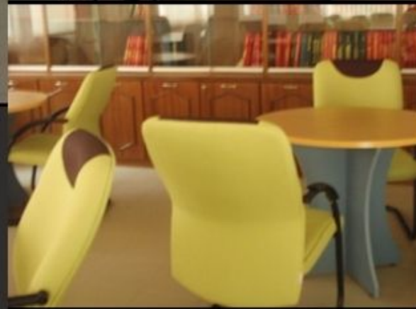
INTERACTIVE ROOM, C06